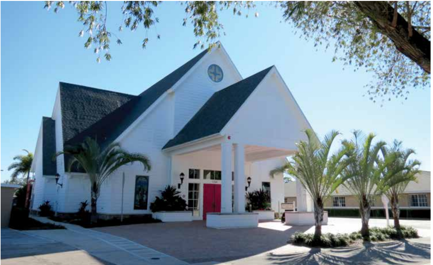
The Chapel at Sunnyside Village.